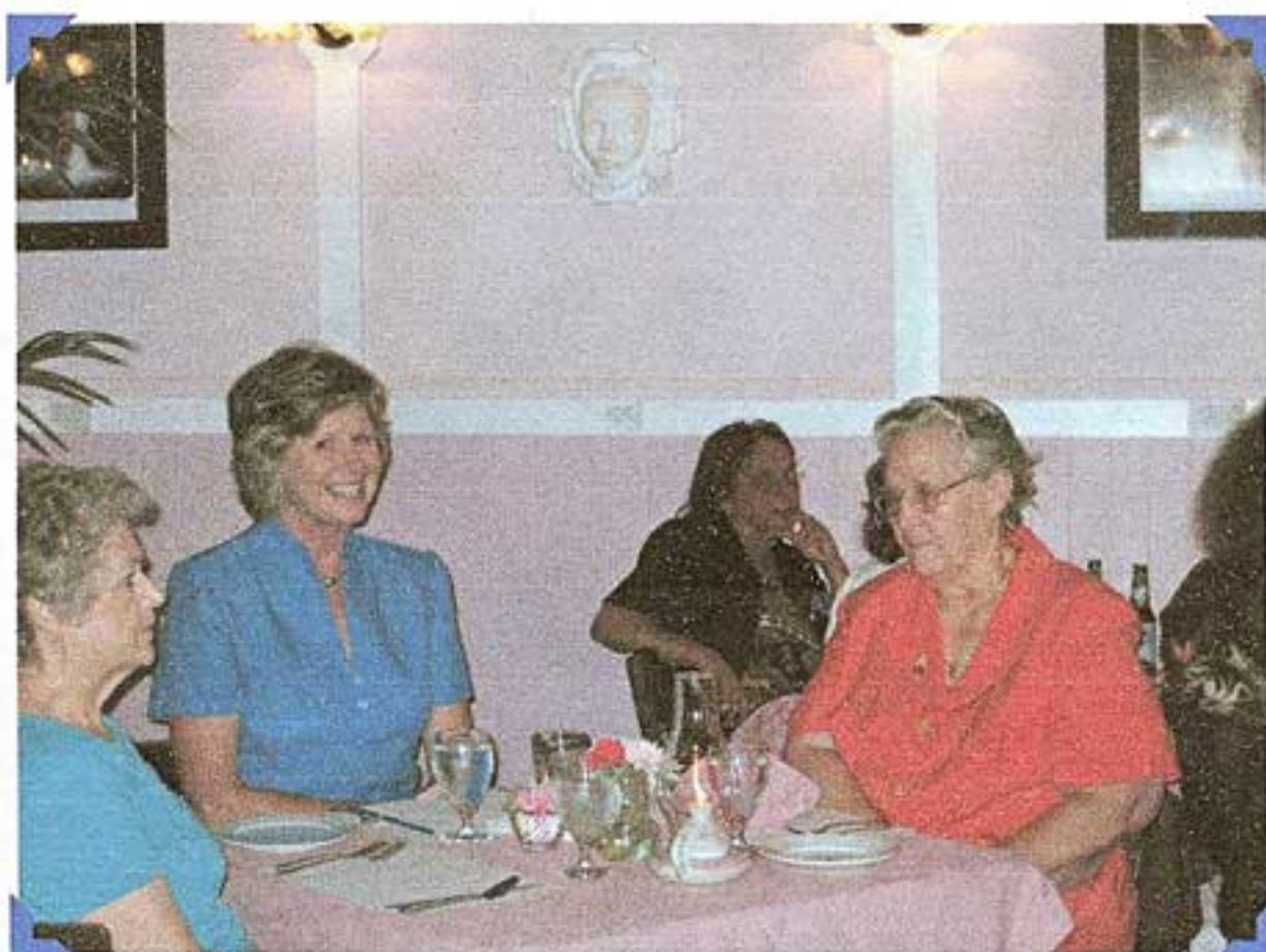
Installation Dinner 2008 at Island Hotel. Lots of time for photos. On the left is our scholarship recipient. On the right are four hungry lions - one who thought someone said "Cheese"